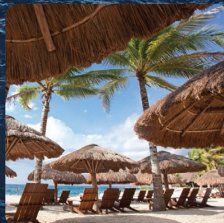
Costa Maya (Mahahual), Mexico