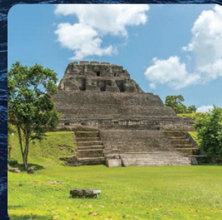
Belize City, Belize